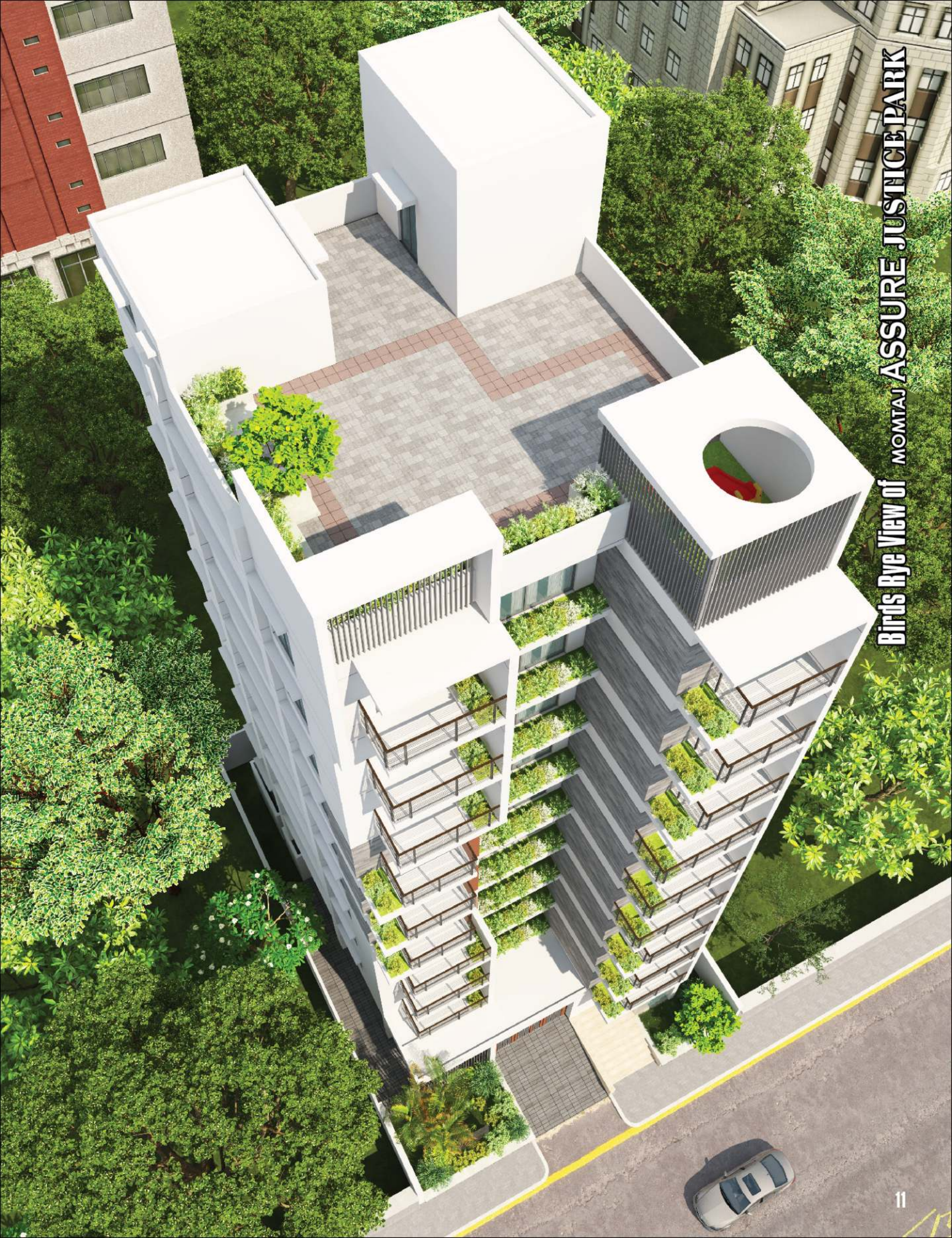
Birds Eye View of MOMTAJ ASSURE JUSTICE PARK